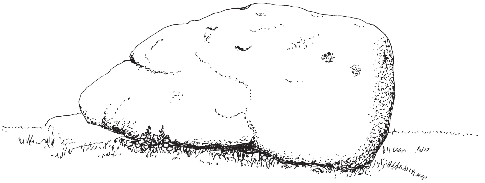
Dunstone [M 16]